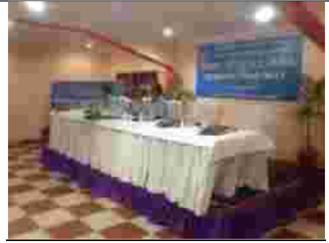
At Jharsuguda with NTPC