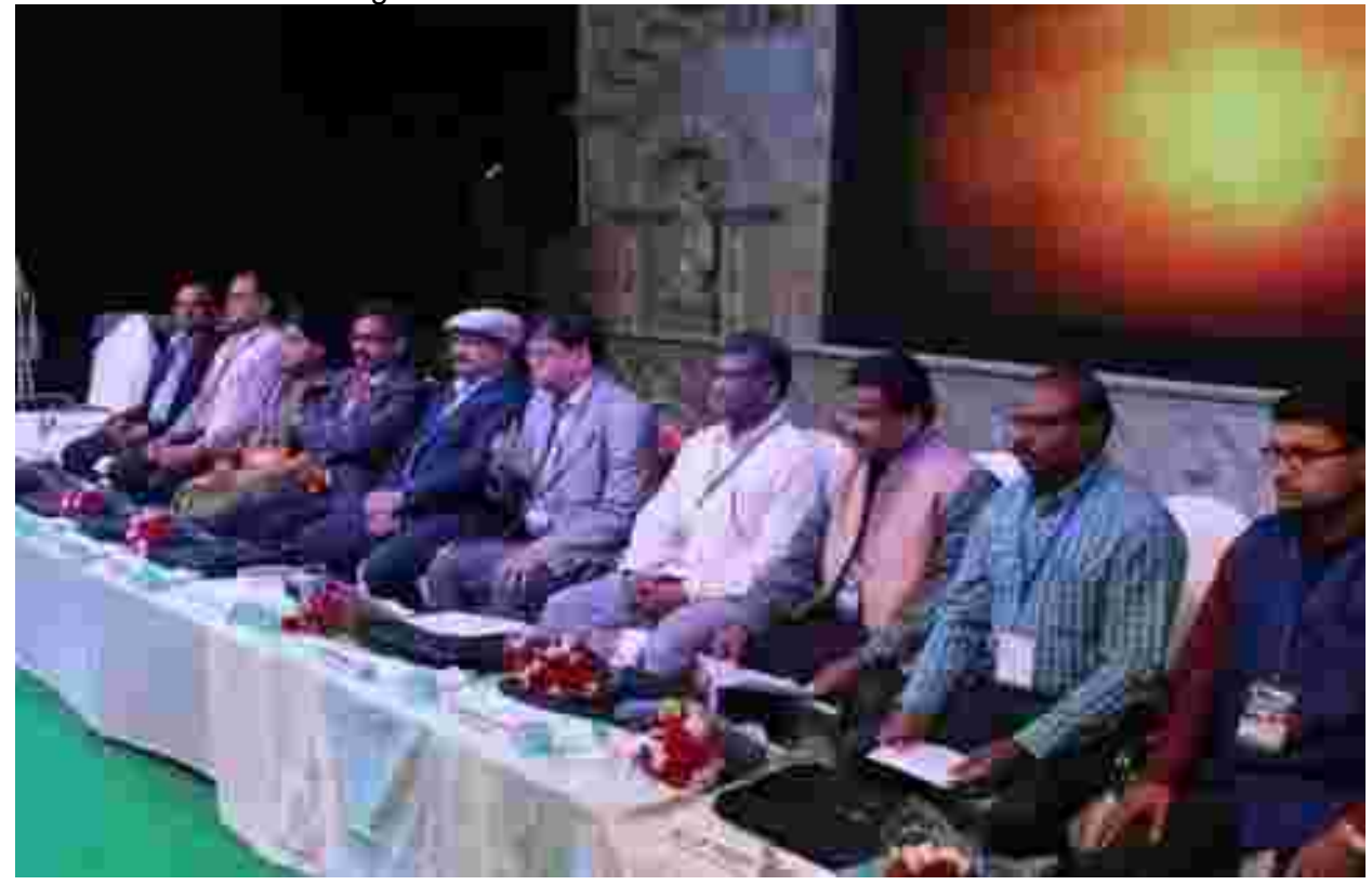
Dignatires on the Dais during the MSME-EXPO Odisha 2018 held at Balasore