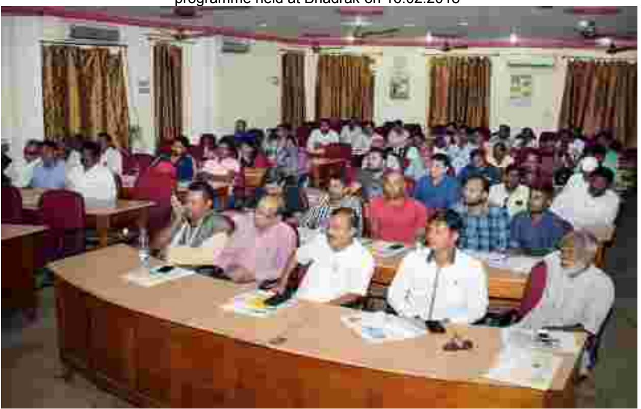
Participants during ZED programme held at Bhadrak