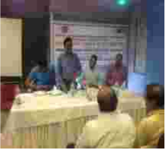
At Jharsuguda with MCL