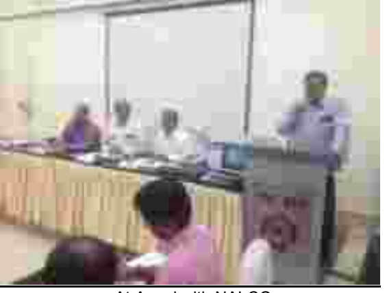
At Angul with NALCO