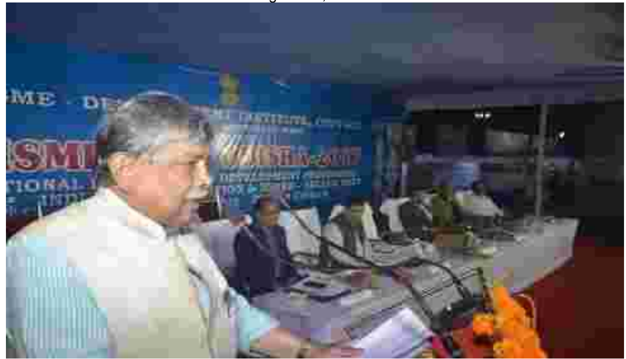
Sri Prafulla Kumar Samal, Hon'ble Minister of MSME, Women and Child Development and Mission Shakti, Social Security & Empowerment of Persons with Disabilities, Government of Odsha addressing during National Vendor Development Programme, Cuttack