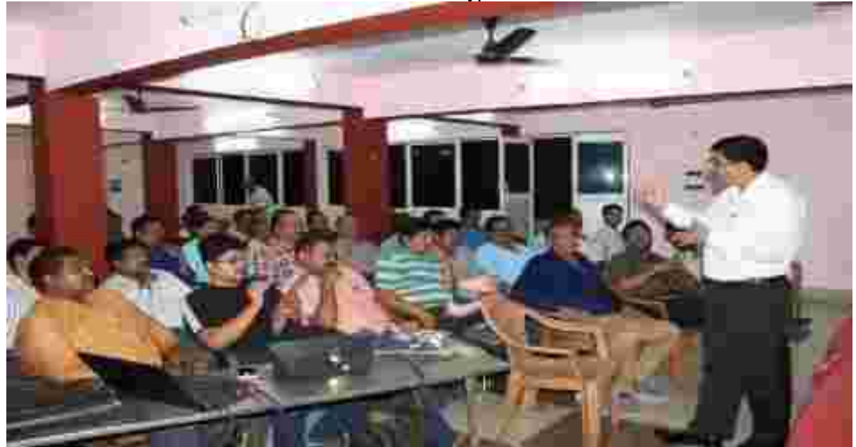
Participants during the programme of ZED on 13.07.17 at Jeypore, Odisha