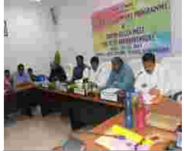
At Damanjodi with NALCO