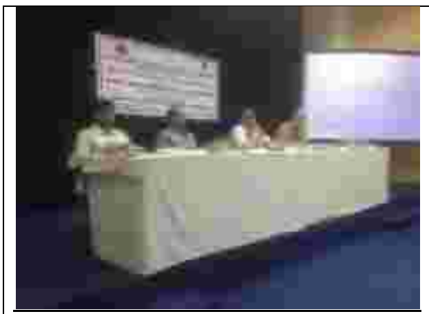
At Rourkela with RSP