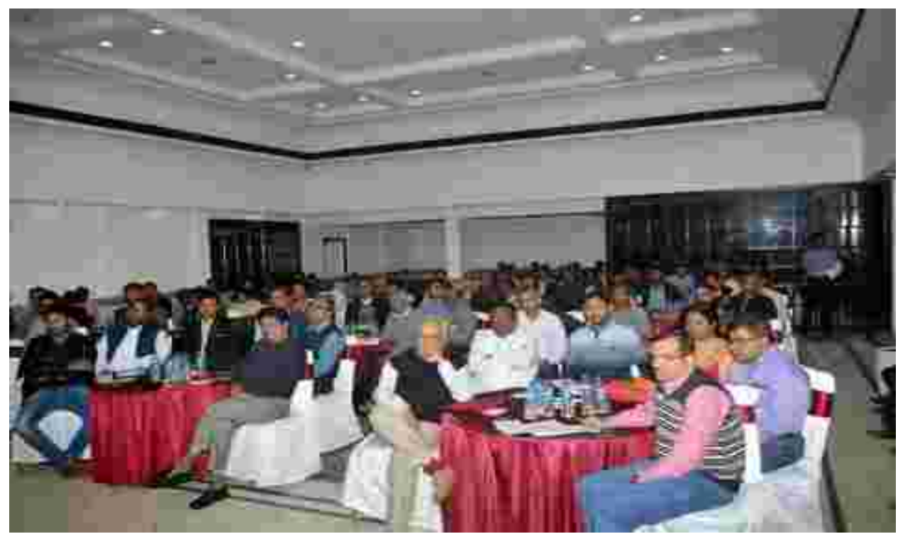
Participants during National Workshop on Public Procurement Policy, Government e-Marketplace (GeM), Packaging for Exports & ZED at Hotel Kalinga Ashok, Bhubaneswar.