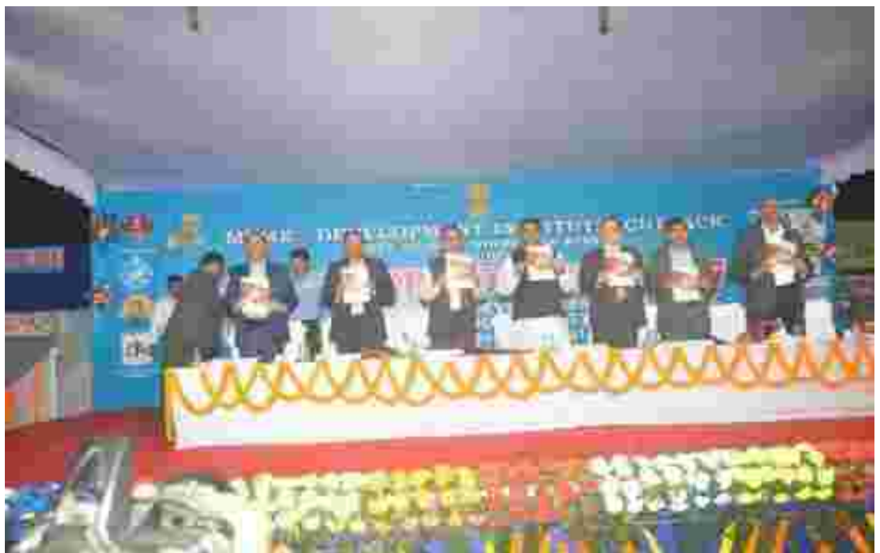
Unveiling Souvenir during National Vendor Development Programme, Cuttack