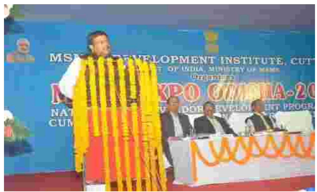
Sri Dharmendra Pradhan, Hon'ble Union Minister of Petroleum & Natural Gas, Skill Development and Entrepreneurship addressing during National Vendor Development Programme, Cuttack