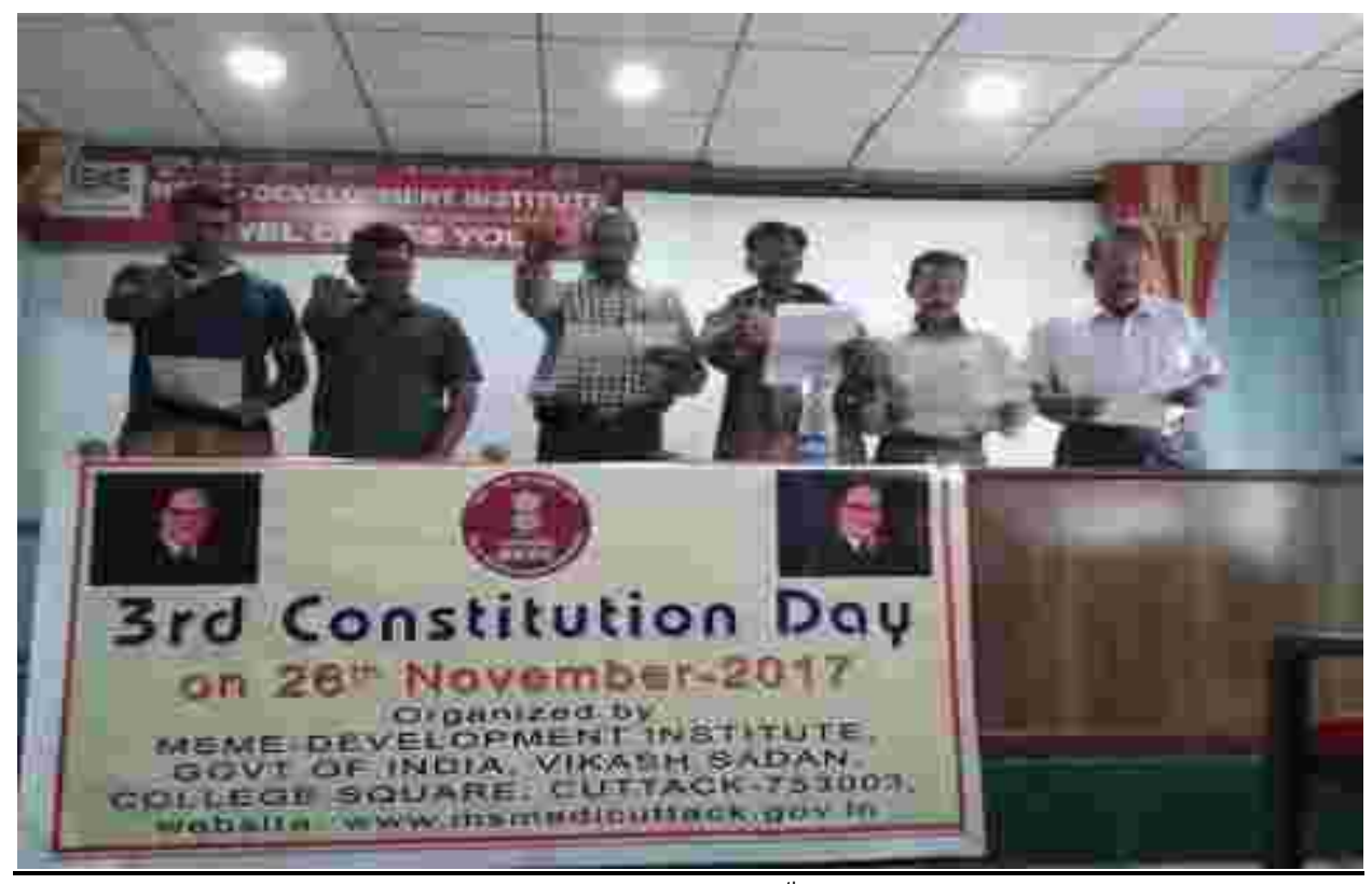
Constitution Day observed on 26th November, 2017